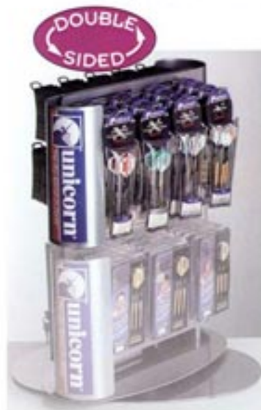
85125 Solo Rotating Counter Stand – double sided Width 520mm Depth 315mm Height 310mm - accepts two half width fittings