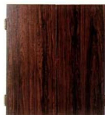
46009 2 cabinets per master carton