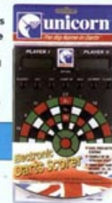
46000 3 computers per master carton