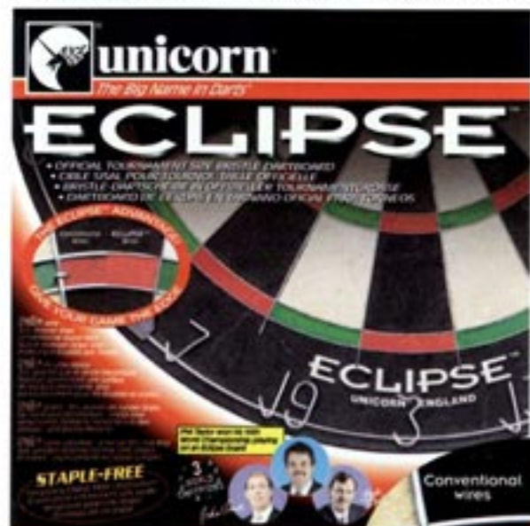
79384 5 boards per master carton